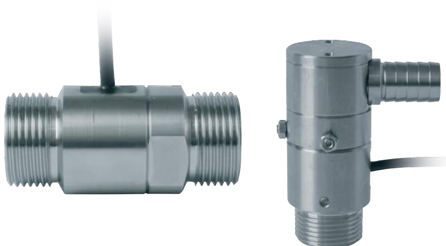
TURBINOX - TURBINOX 90°