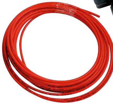
10 METERS HOSE